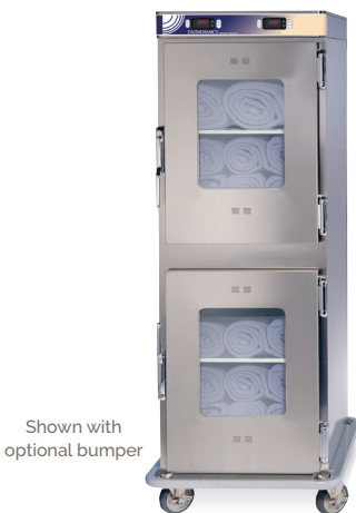
Shown with optional bumper