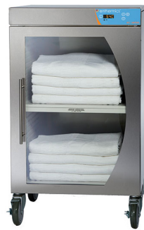
EC750 with optional casters