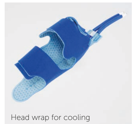
Head wrap for cooling