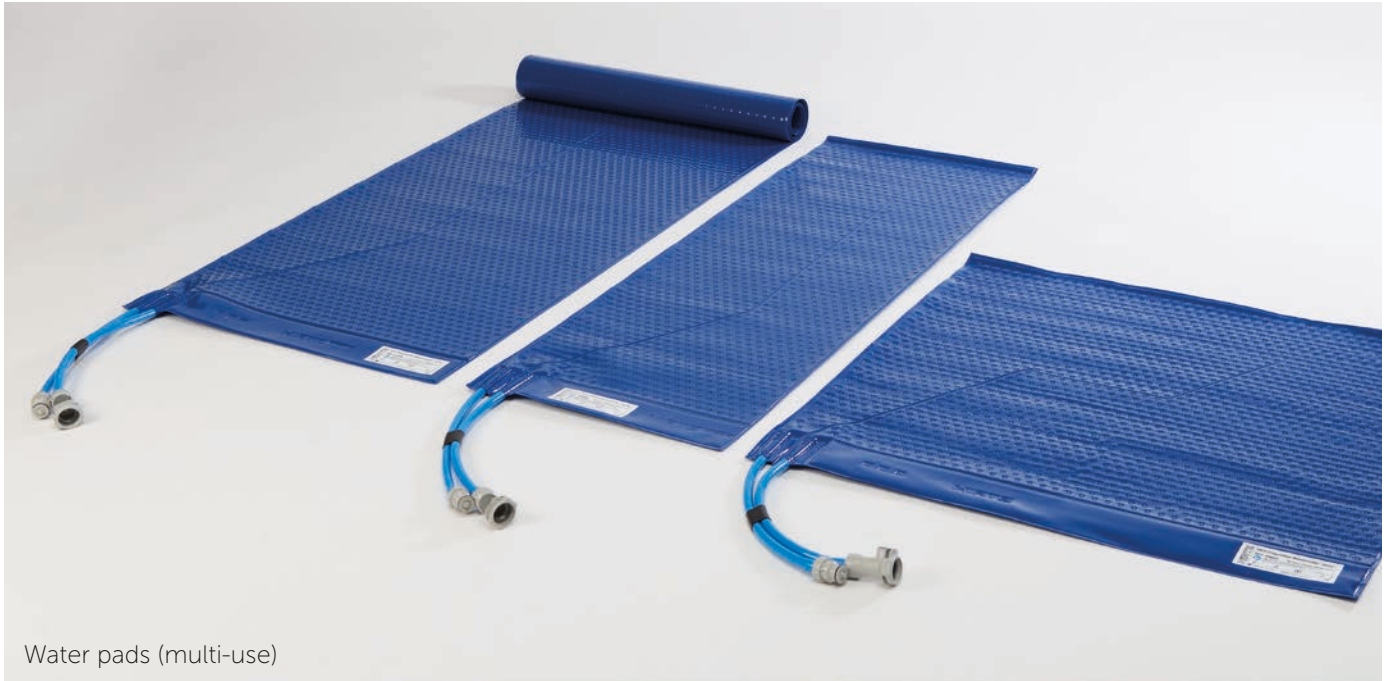
Water pads (multi-use)

Essential accessories for ensuring optimum patient temperature control