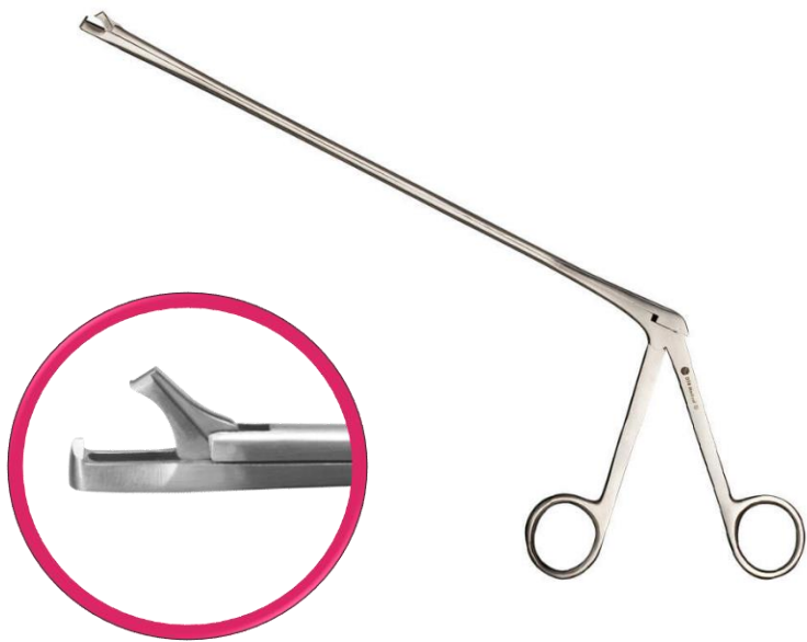
Baby Tischler 2.6 x 8.5mm cut size