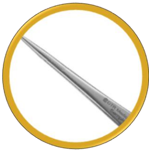
13mm tip length