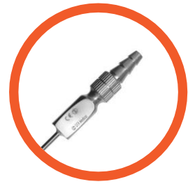
Without suction control