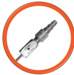
With suction control