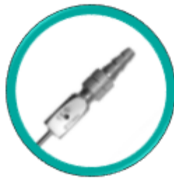
With suction control