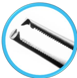
Fine Tip Adson Toothed Forceps - 22mm tip length x 1.5mm tip width