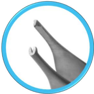
Adson Toothed Forceps - 2mm tip width