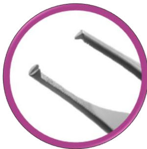
Adson Forceps with Plateau- 1.4mm tip width