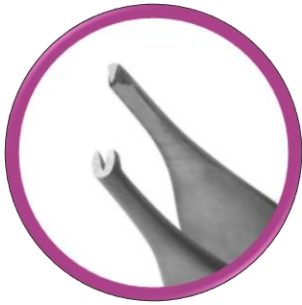
Adson Toothed Forceps - 2mm tip width