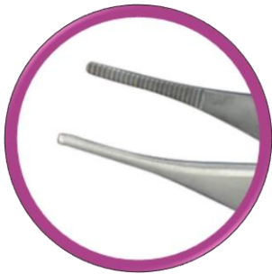
Adson Non-Toothed Forceps - 15mm tip length x 2mm tip width