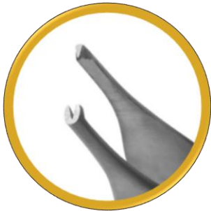
Adson Toothed Forceps - 2mm tip width