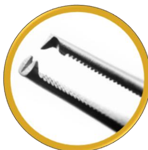
Fine Tip Adson Toothed Forceps - 22mm tip length x 1.5mm tip width