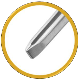
2mm length x 3mm width