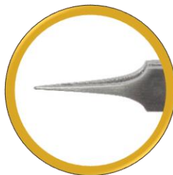
STF2725- 5mm length x 0.35mm width