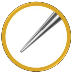
BTF2115- 6mm length x 0.4mm width