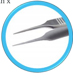
STF2905- 6mm length x 0.3mm width