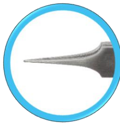
STF2725- 5mm length x 0.35mm width