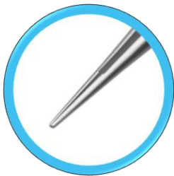
BTF2115- 6mm length x 0.4mm width